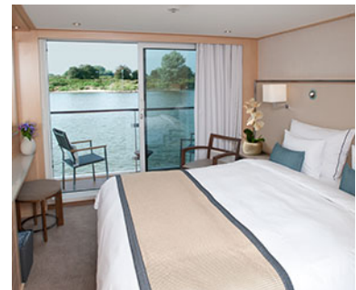
Veranda Cabin (B & A)