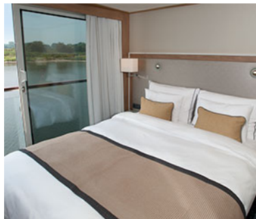
French Balcony (D & C)