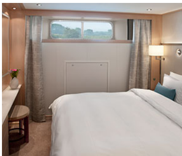
Standard Cabin (E)