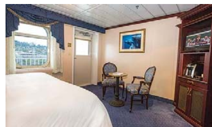
Category B– Superior Private Veranda—210-250 sq feet