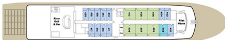
VISTA VIEW DECK