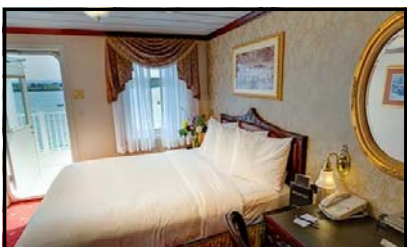
Category E– Veranda open to public deck—150 Sq feet

Day 9: Clarkston, WA: After breakfast we say goodbye to the wonderful staff and make our way back home taking with us wonderful memories of the Pacific Northwest! Your motorcoach awaits your arrival at Bradley.