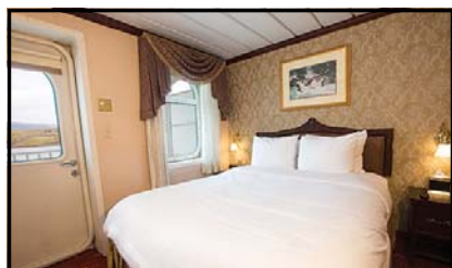
Category C– Deluxe Private Veranda—180 sq feet