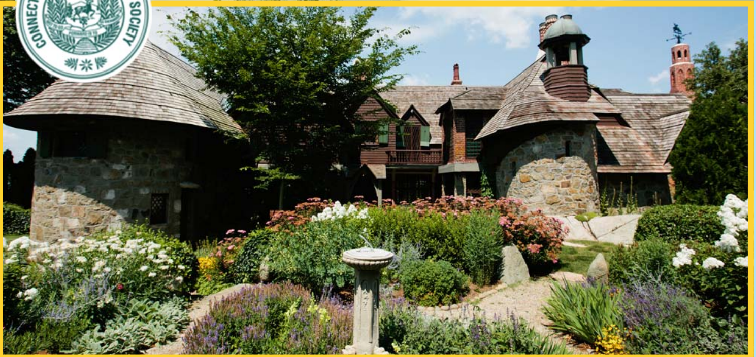
Beauport Sleeper McCann House