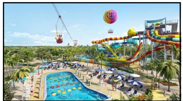
Perfect Day at Coco Cay!