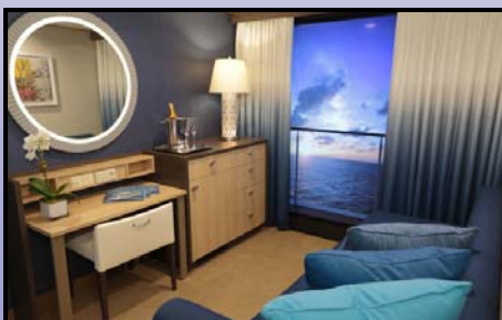
Inside Cabins have a "virtual balcony!"