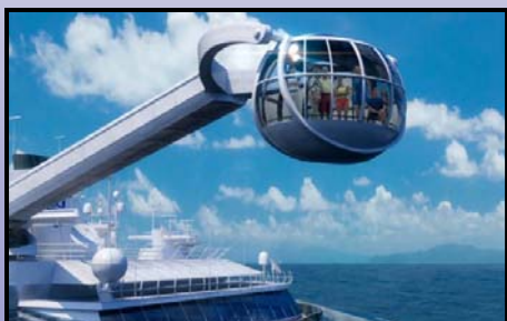
"North Star" Ascends 300 ft above the ocean!

705 Bloomfield Ave, Bloomfield, CT 06002 860-243-1630 • 800-243-1630