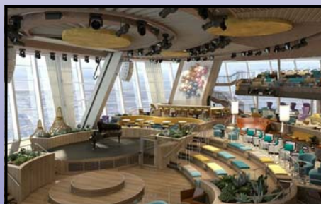
Two70 Lounge by day