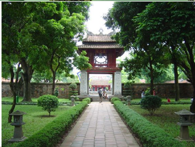
By Chuoibk at English Wikipedia