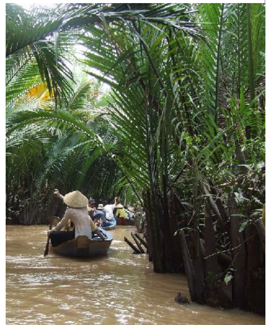
By User:Doron - Own work