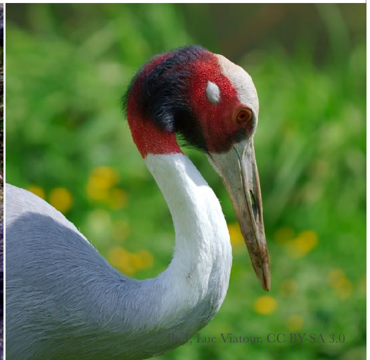
By E. Luc Viatour, CC BY-SA 3.0