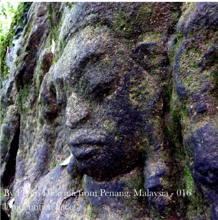
016 Unidentified face

Leave Siem Reap after breakfast for a day trip to Ang Trapeang Thmor, a nature reserve based around a reservoir dating from the Khmer Rouge era. Today is devoted to birding and enjoying the diversity of the natural world. The reserve is a unique wetland set amongst grasslands, dipterocarp forest and rice fields and is an important wintering site for the endangered Eastern Sarus Crane. Highlights of Ang Trapeang Thmor are the breeding colonies of Spot-billed Pelican and Painted Stork and large numbers of waterfowl including Spot-billed Duck, Cotton Pygmy Goose, Garganey, Black-backed Swamphen, Pheasant-tailed and Bronze-winged Jacanas. Return to Siem Reap in the late afternoon. Overnight at Siem Reap. B, L, D