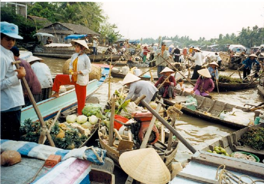
By Teijo Hakala from Jyväskylä, Finland - Mekong Delta river