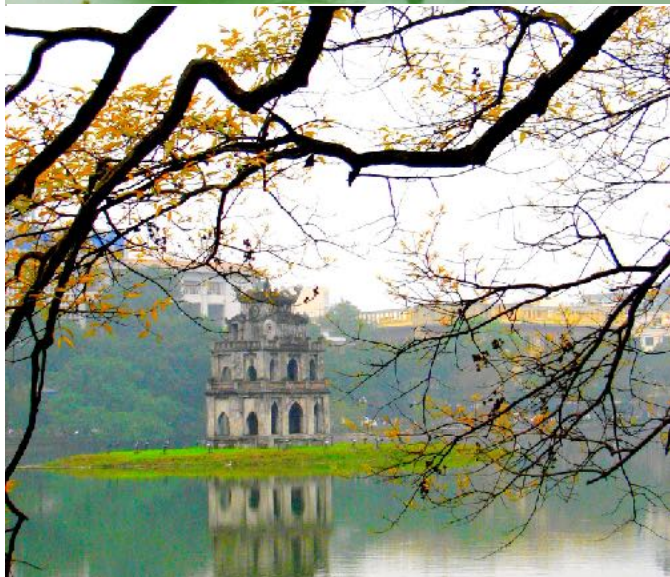
By Cyril Doussin from London, United Kingdom