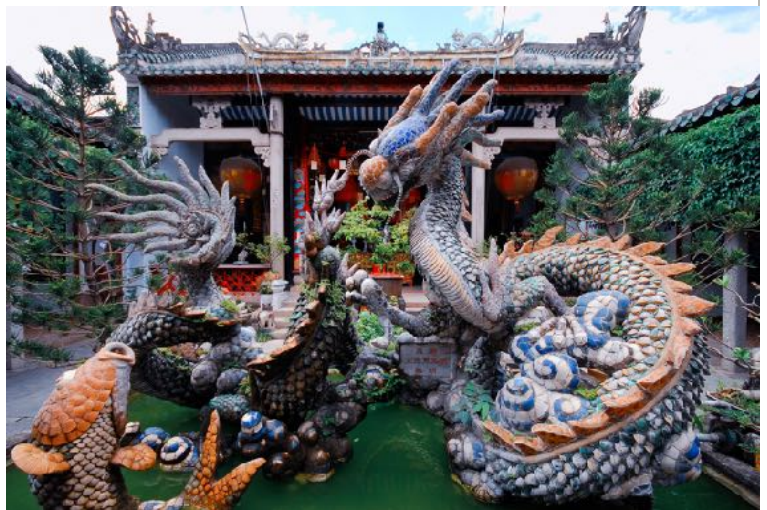
Hoi An Laternen und Lampions